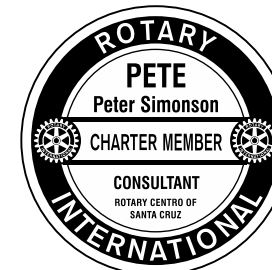
CHARTER MEMBER Style RT-59 (Blue & Silver)