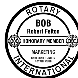
HONORARY MEMBER BADGE Style RT-68 (Gold & Blue)