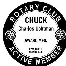
MEMBER BADGE Style RT-71

Magnet backing Specify "M" on Order Form