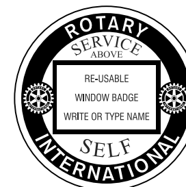
RE-USABLE WINDOW BADGES 4 FOR $12.95 RT-66 (Blue & Gold) RT-67 (Red & Gold)

TO PAY BY CREDIT CARD, ORDER VIA WEBSITE